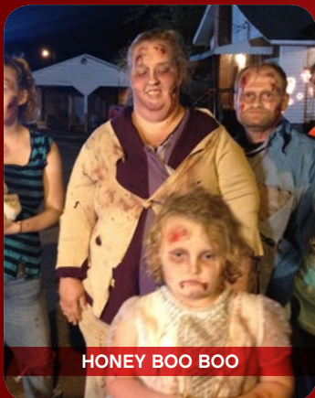
HONEY BOO BOO